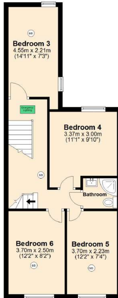
First Floor Approx. 49.4 sq. metres (531.7 sq. feet)