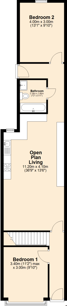
First Floor Approx. 33.7 sq. metres (362.3 sq. feet)

Approx. 72.0 sq. metres (774.9 sq. feet)