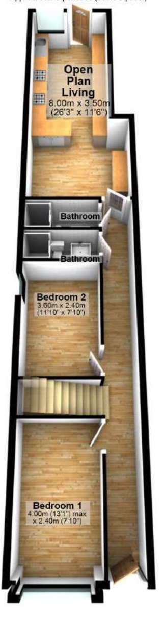
Ground Floor Approx. 63.7 sq. metres (685.6 sq. feet)