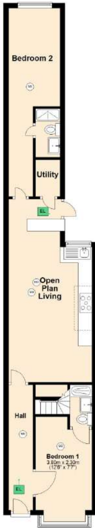
Ground Floor Approx. 59.4 sq. metres (628.3 sq. feet)