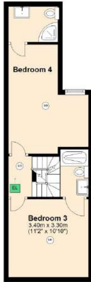
First Floor Approx. 31.2 sq. metres (335.5 sq. feet)